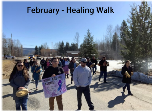
February - Healing Walk