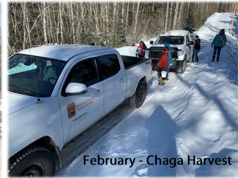
February - Chaga Harvest