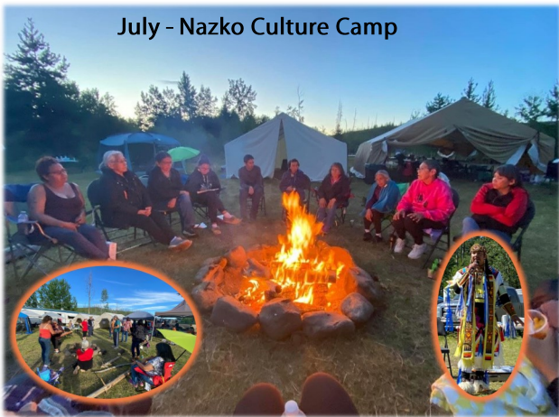
July - Nazko Culture Camp