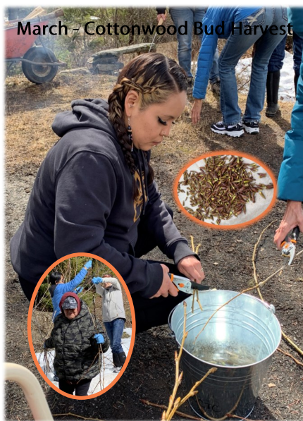
March - Cottonwood Bud Harvest