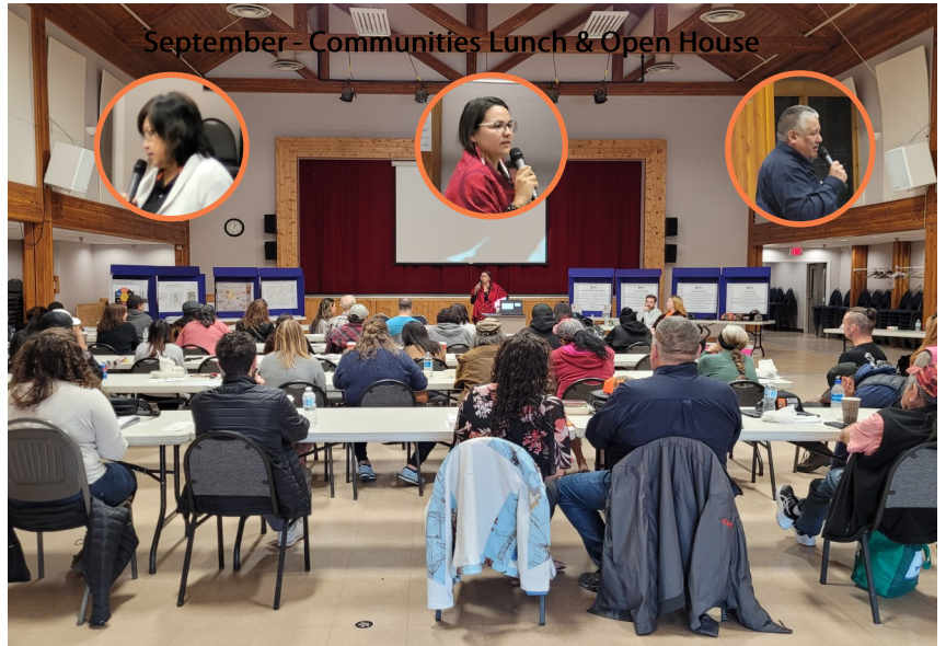
September - Communities Lunch & Open House