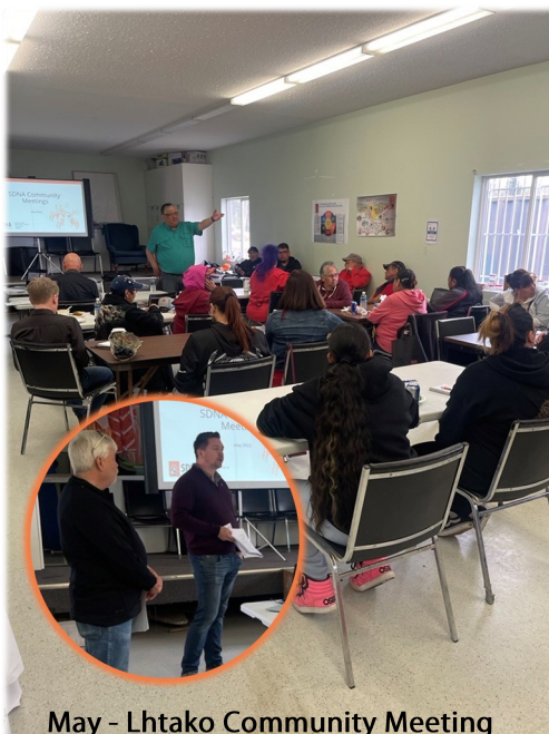
May - Lhtako Community Meeting