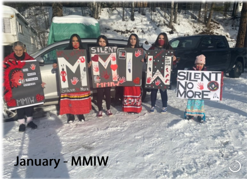
January - MMIW