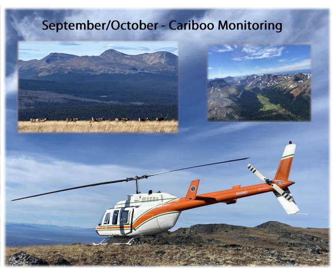
September/October - Cariboo Monitoring