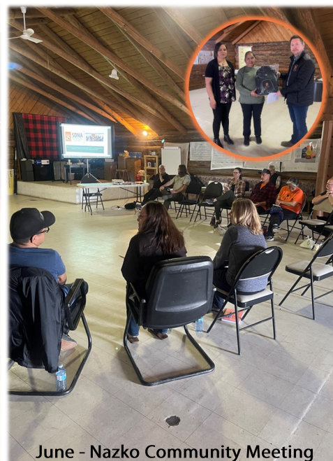
June - Nazko Community Meeting