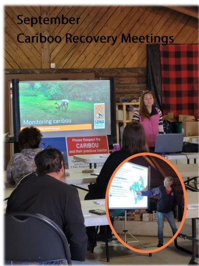
September Cariboo Recovery Meetings