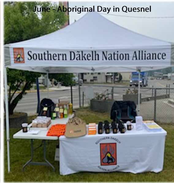
June - Aboriginal Day in Quesnel