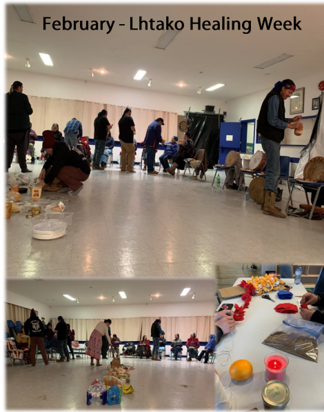
February - Lhtako Healing Week