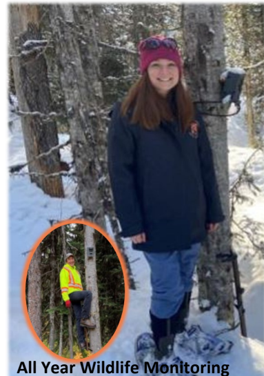
All Year Wildlife Monitoring