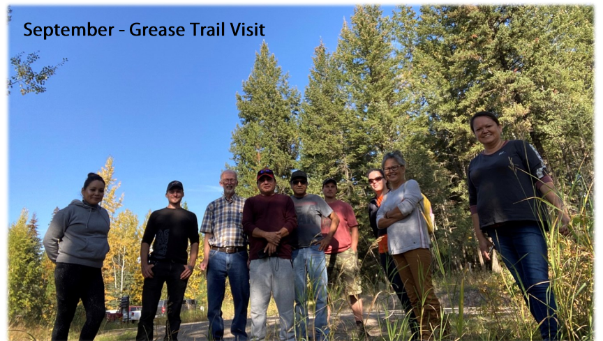
September - Grease Trail Visit