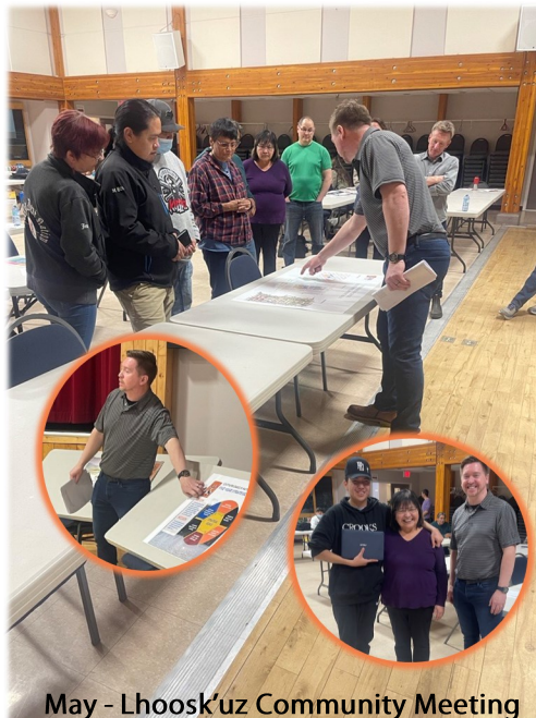
May - Lhoosk'uz Community Meeting